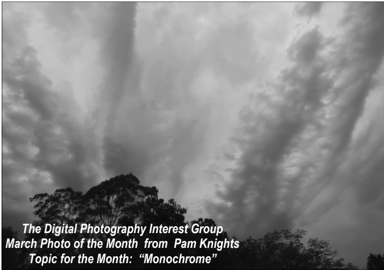
The Digital Photography Interest Group March Photo of the Month from Pam Knights Topic for the Month: "Monochrome"